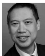
Dow-Mu Koh London/United Kingdom