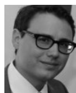
Timm Denecke Universitätsklinikum Charité Berlin/DE Oncologic CT Imaging and CT Tumour Perfusion