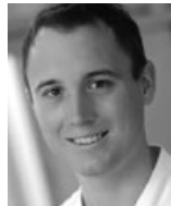
Paul Flechsig Heidelberg/Germany