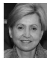
Hedvig Hricak New York/USA